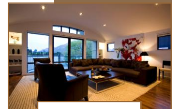
50B Park Street