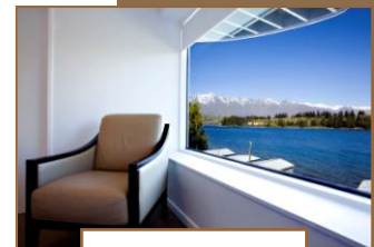
50B Park Street