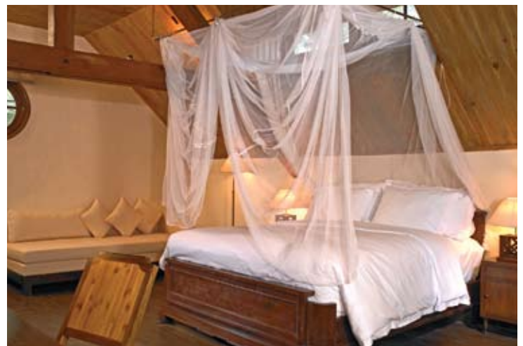
Villa Suite Bedroom

Have separate lounge and / or terrace areas and expansive room size, without any compromise to the original design and décor.