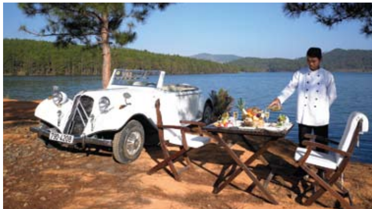
Picnic at Tuyen Lam Lake

With one of the best wine lists in Vietnam, Evason Ana Mandara Villa - Dalat is a world class food and beverage destination.