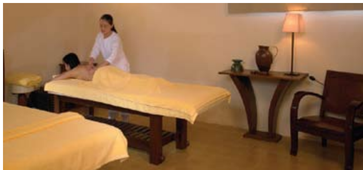
Six Senses Spa

The Six Senses Spas provides perfect harmony between relaxation and revitalizing, offering therapeutic treatments to balance the senses. It is designed with pampering and healing therapies focusing on health, relaxation, beauty, stress reduction and recuperation from the everyday pressures of the hectic world. The Six Senses Spa offers an unrivalled range of treatments from which to choose, with international therapists advising and guiding you through the options of body and beauty care, mind and body balancing, and juice and herbal remedies.