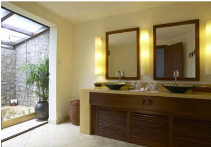
Bathroom - Deluxe Sea view Villa

Evason Ana Mandara & Six Senses Spa is managed by Six Senses Resorts & Spas, who have developed and operate unique properties in Maldives, Oman, Thailand, Vietnam, Spain, Fiji and Jordan under the brand names Soneva by Six Senses, Six Senses Hideaway, Six Senses Latitude and Evason: plus Six Senses Spas and Six Senses Destination Spas. The Six Senses team has positioned Evason Ana Mandara to incorporate the same brand values and personal service promised in the Six Senses Core Purpose: To create innovative and enriching experiences in a sustainable environment.