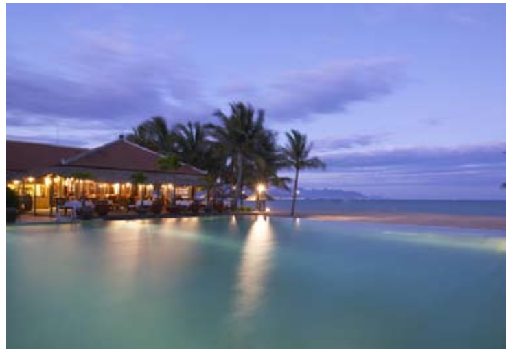
Infinity Pool - Beach Restaurant

We offer full day beach service, food to go as well as 24 hours in villa dining. Additionally, we offer a range of private dining options with special menus at a variety of locations such as the beach, pool, jetty, Spa or an island.