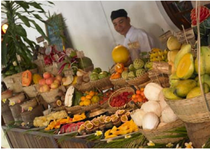
Breakfast - Ana Pavilion Restaurant

The versatility and the geographical location of the city of Nha Trang allow us to offer a wide range of different excursions; so that you fully enjoy an unforgettable Vietnamese experience. All tours can be tailor -made to suit your requirements and individual preferences. Our tours include Mountain & Jungle Expeditions; Island / River / Fishing Tours; Market Tours; Culinary & Tasting Tours; City & Shopping Trips as well as Cultural Excursions.