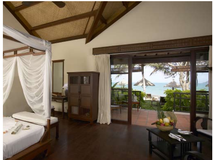
Ana Mandara Suite