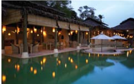
The Ton-Sai Restaurant

In addition we make sure our weekly event calendar includes pizza baking, island barbecues and special dishes prepared in our own tandoori oven, making sure dining experiences at the Six Senses Destination Spa are most memorable.