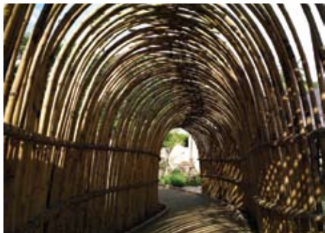
Entrance to the 7 th Sense

Supporting the concept of life enrichment, accommodations at Six Senses Destination Spas provide generous personal space and present an uncompromised standard of natural luxury with elegantly designed architecture and natural furnishings. Positioned as the destination spas of the twenty-first century, they support the Six Senses Destination Spa theme – Enriching Life .