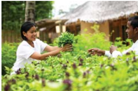
Herbal Spa Garden

The Journey of life presents us with many challenges and transitions along the way. Every major change in life is a passage. Each passage we encounter can be an opportunity to heal the wounds from the past, go deeper into the meaning of our life, find renewed strength, open to intimacy and realize our fullest potential.