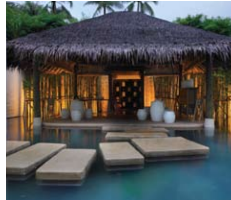
Chinese Spa Tea Room