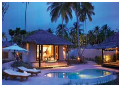
Beach Pool Villa